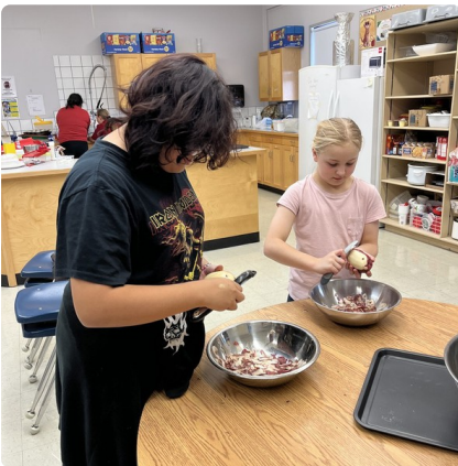
Peeling potatoes from our garden