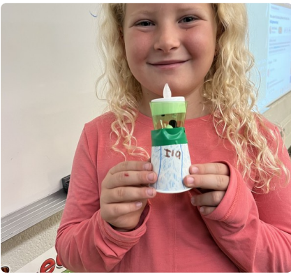
The 1/2/3 class built lighthouses to learn about Meteghan.