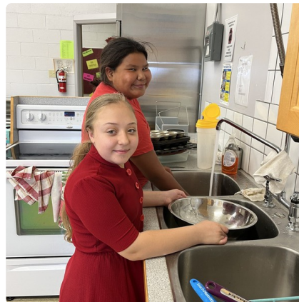
Washing the garden vegetables