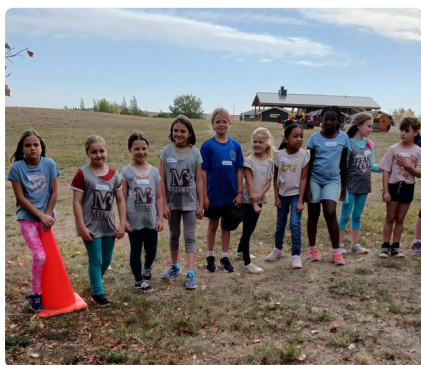
At the starting line!