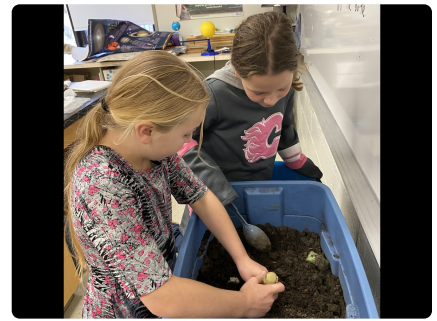
Vermipost is a good way to get rid of food waste.