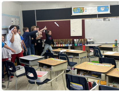
Air and aerodynamics lesson with paper airplanes.