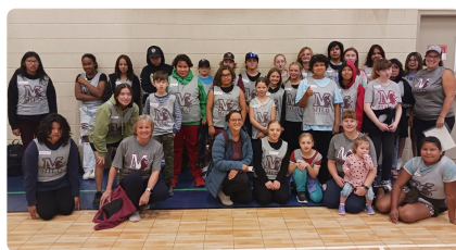
Looking good representing Milo School